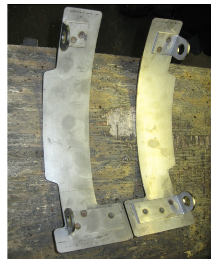
EX-5250R / FD450-01BG