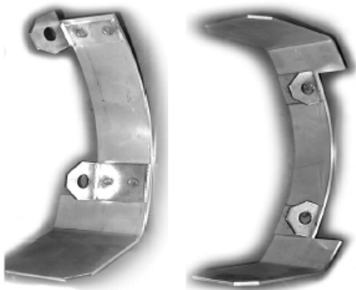
EX-4500 / FD250-01BG

Protectors Note the offset brackets for bolting to calipers.