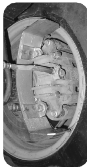
Passenger Side installation