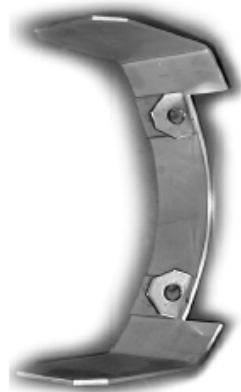
DG1500-01BG/ EX-4250 Protector for 2002 and newer 1/2-Ton single wheels.

Note: The guard should rest close to the rim, but not physically contact its surface.