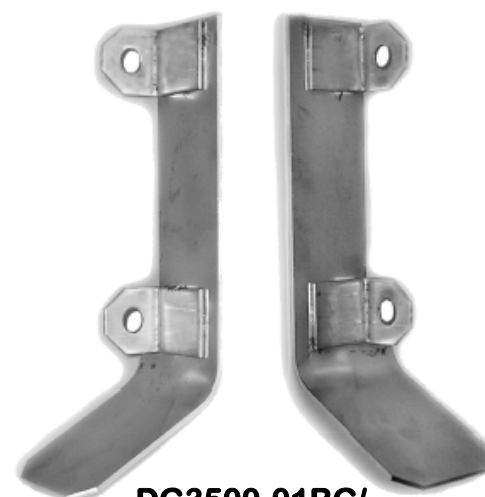
DG3500-01BG/ EX-6000DW Protector