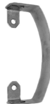
EX-2500 / CH1500-02BG pictured above

EX-2500 HD/CH2500-01BG has the mounting tabs in different positions